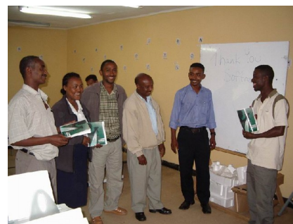
SSRA staff in Awassa Ethiopia

Softree is proud to contribute engineering software to the South Rural Road Authority (SRRA) in Awassa Ethiopia. Through Softree’s assistance, SRRA will be able to work more efficiently and accurately, and also keep up with modern Western engineering tools.