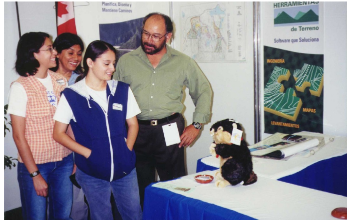
Softree Español Booth at Expo Forestal Mexico

More information is available at www.softree-espanol.com or by calling (250) 337-5880.